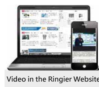
Video in the Ringier Website