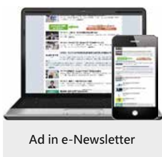
Ad in e-Newsletter