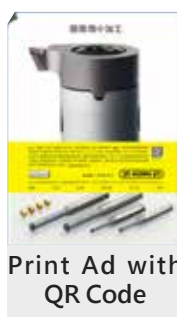
Print Ad with QR Code