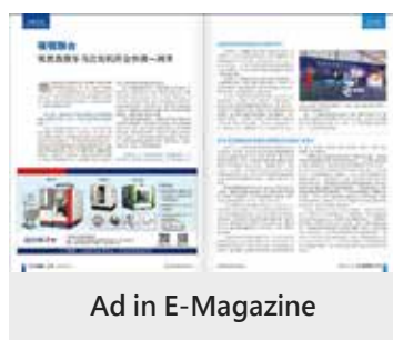
Ad in E-Magazine

Extend the exposure of your brand and product to intensify buyer' impression