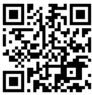
Live Broadcast example