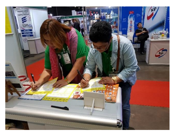
↑People were signing up for the magazine at Ringier's booth in Southeast Asia.