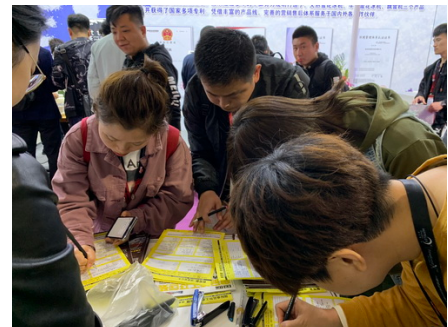
↑ People were signing up for the magazine at Ringier's booth

During the 14th Five-Year Plan period, several factors will impact China's socio-economic conditions and together with the adjustment of the world economic structure following the onslaught of the pandemic, new changes of industry development will be seen. In this critical period, new emerging fields are expected to need the strong support from the plastics industry. For example, the aging of the population will give birth to a huge health, medical and elderly care industry; new material industries, including graphene, carbon fiber, emerging membrane and bio-based materials, will become in high demand; the development of new energy industry will require a large number of high quality internal and external trims, battery films and other plastic products; artificial intelligence will reshape the rubber and plastics industry; and environment protection and recycling will be integrated into the production process of those engaged in plastics and rubber manufacturing.