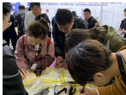
↑ People were signing up for the magazine at Ringier's booth

Electronics and Semiconductor Manufacturing: China's semiconductor market grows rapidly in the first half of 2021 amid the global demand for semiconductor products. Statistics from China Semiconductor Industry Association shows sales volume of integrated circuit industry in January-June 2021 was 410.29 billion yuan, up by 15.9% year-on-year. The design industry went up by 18.5% year-on-year, with sales of 176.64 billion yuan. Meanwhile, manufacturing increased by 21.3% year-on-year, with sales of 117.18 billion yuan; packaging and testing industry rose 7.6% year-on-year, posting sales of 116.47 billion yuan. Semiconductor manufacturing also puts forward higher requirements for equipment and processing technology, and special equipment such as multi-functional machine tools, high-speed engraving and milling machine tools, five-axis machine tools and so on, to help alleviate the "lack of chip".