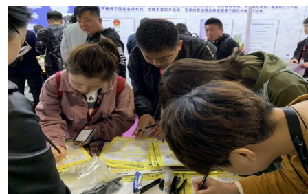
↑ People were signing up for the magazine at Ringier's booth

With the implementation of China's 14th Five-Year Plan (2021-2025), the high-end manufacturing equipment industry will demonstrate a rapid growth trend in the next five years.